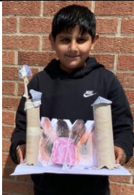
They even made their own castles in D/T.